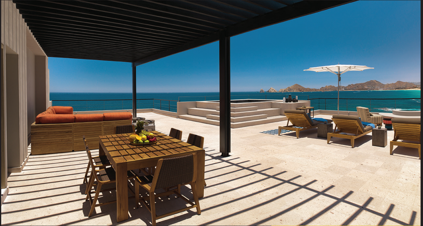
THREE BEDROOM PENTHOUSE