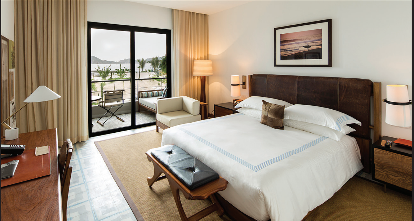
TWO BEDROOM VILLA