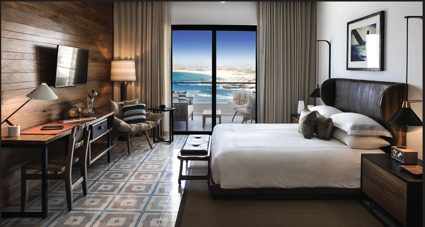
THREE BEDROOM VILLA