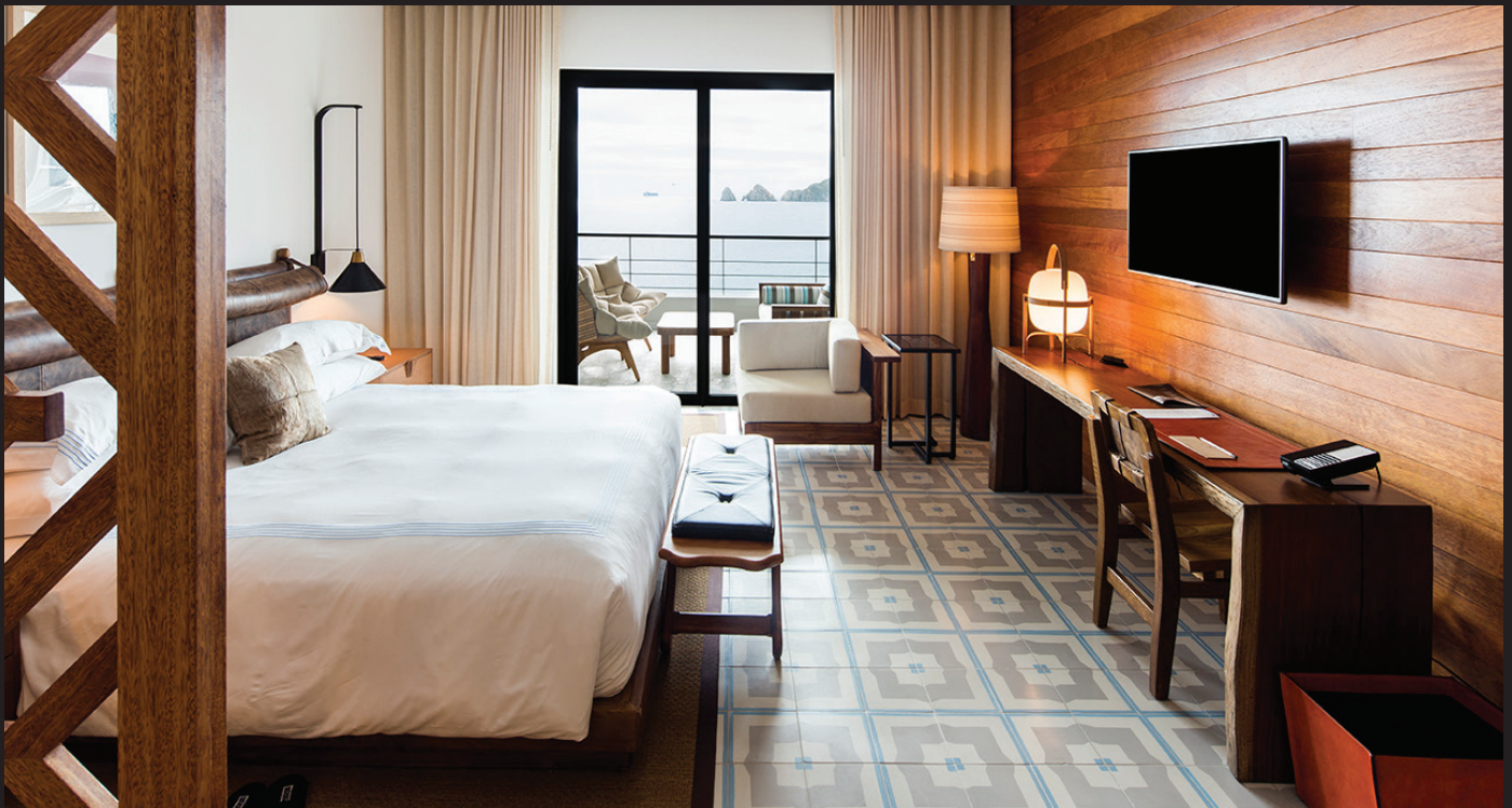
ONE BEDROOM VILLA