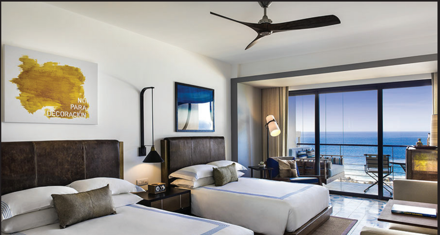
DELUXE TWO QUEEN